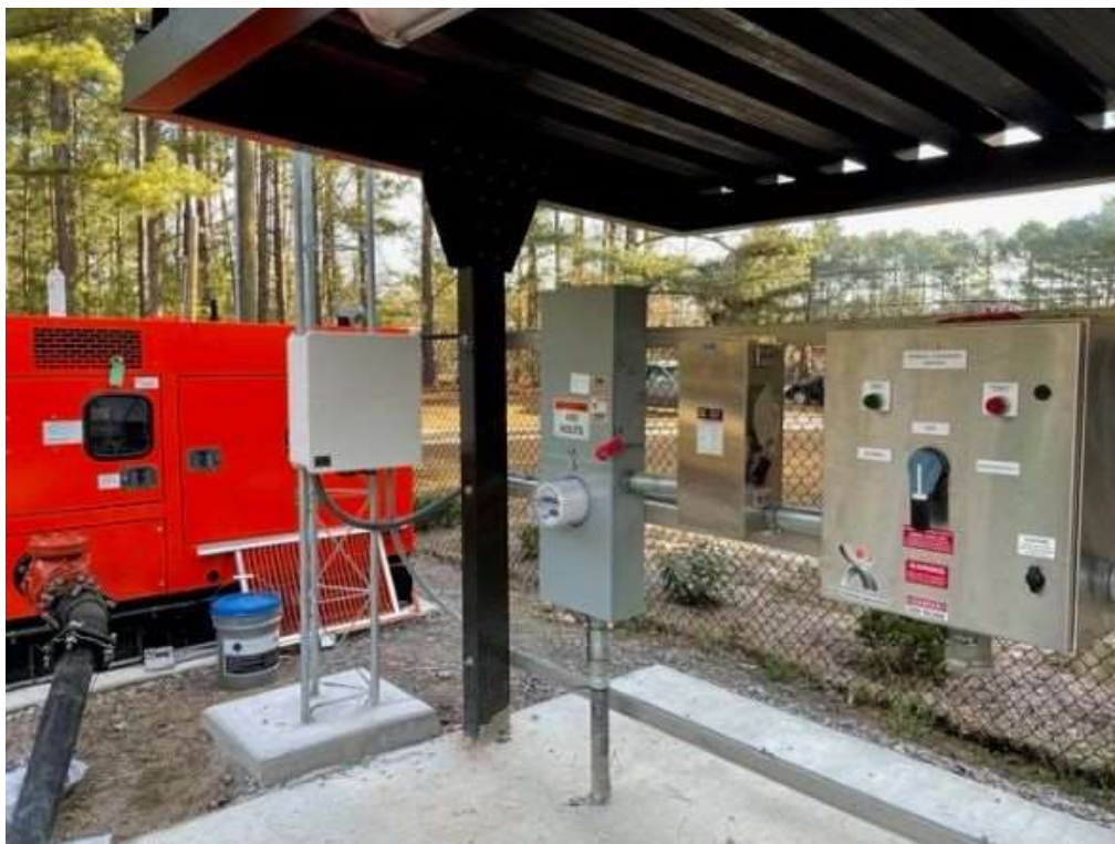
Photo 3: Control panel

The crew installed the Franklin Park control panel. (See photo 3). There is no flagger expected for traffic. Twenty-six (26) out of twenty-six (26) fire hydrants installation completed in Division 3.