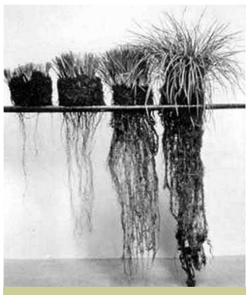
Grazing Management : Pastured livestock should be managed to avoid overgrazing. Plants in overgrazed pastures have poor, shallow root systems and are less tolerant of drought than plants in well-managed pastures. Rotational grazing can help avoid overgrazing.