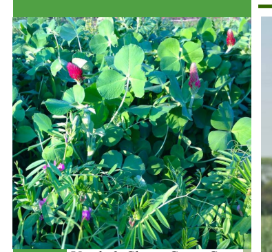
etch & Clover Cover Crop

Richland Soil and Water Conservation District