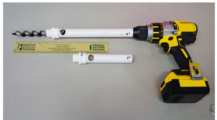
Figure 2. Completed PVC pipes used in the first design to limit sampling depth (one 4” depth; one 8” depth). Note the single hole which will allow soil to exit into the pail when installed.

The simplest way to determine the length of PVC piping required is to first slide a length of it firmly into a 3/4 inch Schedule 40 PVC male adapter (this may be simply friction-fit together instead of glued, since there will be no pressure and little force on the unit). Next, attach the Long Ship Auger to the drill to be used, and place the unit