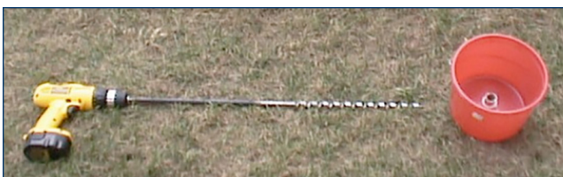
Figure 1. The original Oklahoma State Sweatless Soil Sampler.

There was, however, no way to accurately gauge how deeply the drill bit was going into the soil when obtaining a soil core. Many soil testing labs