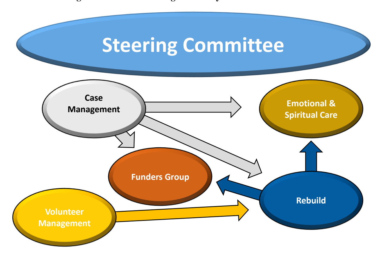
Figure 2: Richland-Lexington County LTRG Structure

Richland County has County staff representation on three of the four work teams: Case Management, Funders Group, and the Rebuild Work Teams. The chair of the Case Management Work Team is a member of the Richland county Staff.