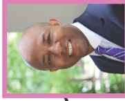
Overture Walker District 8