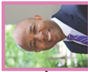
Overture Walker District 8